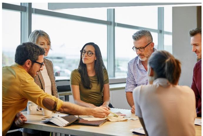
The new research and innovation centre will bring together research findings on self-management and self-determination and put them into practice.

The centre aims to develop the potential of people, professionals, organizations, systems, and communities for creating a society that strengthens empowerment and self-management in people with chronic diseases. Through capacity building, the centre will provide knowledge, skills, motivation and competency to people to act as leaders of self-management and empowerment enhancement in everyday life to improve health and quality of life for all.