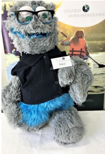
The DIGILO mascot from the Healthy Werra-Meißner District.

The "Gesunder Werra-Meißner-Kreis" network has launched a "Digital Health Guide", or DIGILO for short. DIGILO is a free internet platform that assists users in exploring more than 1400 health offers in Eschwege and the surrounding region. The service includes doctors, therapists, nutritionists, clubs, pharmacies, fitness providers and many more.