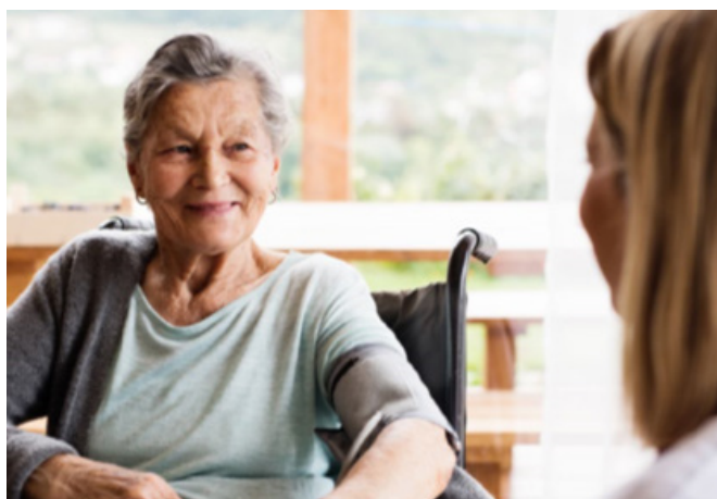
New questionnaire for chronically ill patients determines how their psyche, physical and emotional health is doing.

How do chronically ill people experience their medical care? How are their needs dealt with, especially in the outpatient area? How do they rate waiting times, the transfer of information between doctors, their quality of life, or their psychological well-being, for example? The Organisation for Economic Cooperation and Development (OECD) is investigating these questions with a large-scale study, comparable to the PISA study in the education sector.